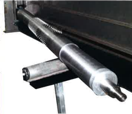
quick change of perforating tools