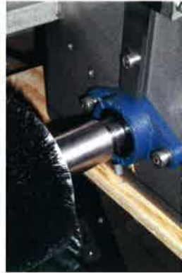
efficient bearing of rollers