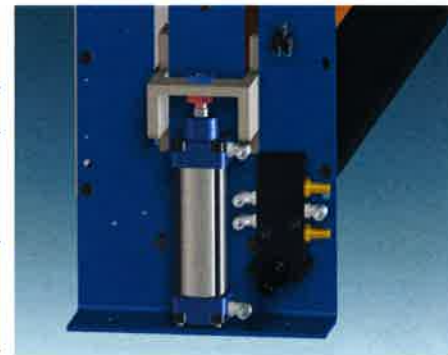
mechanical penetration depth adjustment