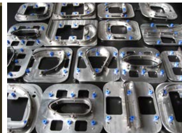
Flexible perforation tool design