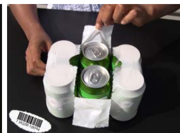
Tear off & opening perforation

Please contact us for more detailed information or visit us on www.burckhardt.com