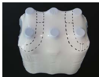
Opening perforation – easy opening