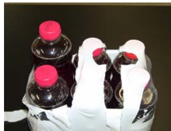
PET-bottles – easy opening with wrapping stability