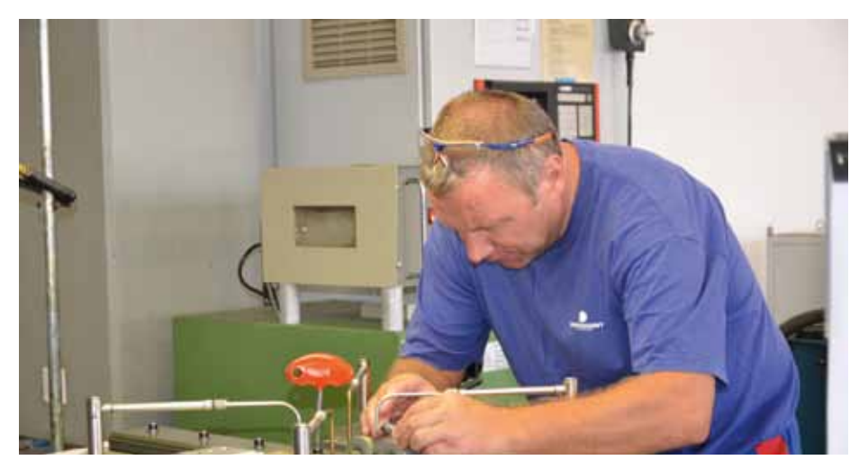
Even high precision tools require experienced handwork