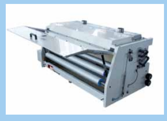
The Hotspeed line from the front view

The line allows a working speed of 300m/min and a working width of 1600mm, features, which make the latest Burckhardt innovation especially attractive for film converting processes for food packaging and other industries.