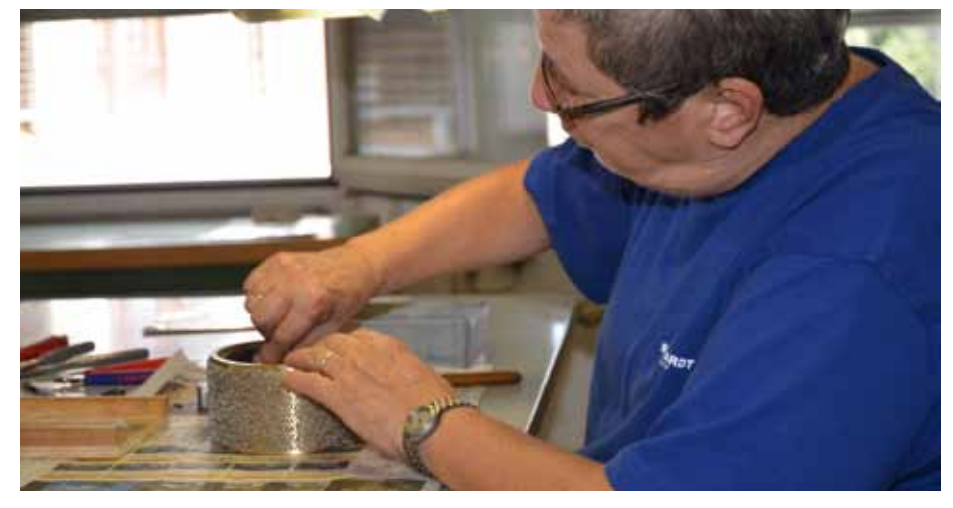
A dozen diligent helpers check the correct fit of hundreds of pins. Nothing escapes their sharp eyes ...

technology provides non-woven fabric with completely new surface properties that are highly appreciated in the manufacture of diaper and feminine care products.