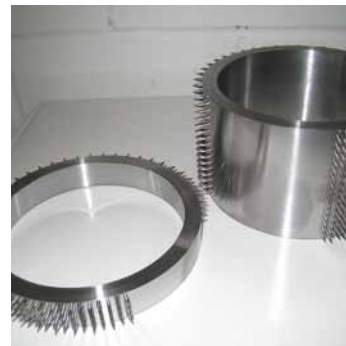
Segmented rings are optional