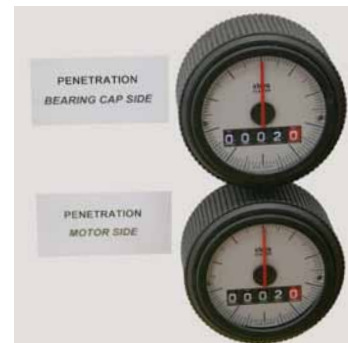
Penetration adjustment with display